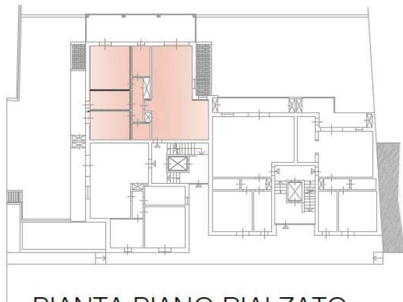
PIANTA PIANO RIALZATO